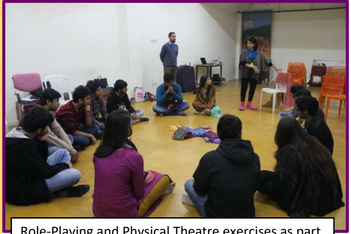
Role-Playing and Physical Theatre exercises as part of the orientation workshops.

Following our sessions, students from IIT Delhi were placed in Adharshila Observation Home for Boys, Kingsway Camp and Salaam Balak Trust Childrens Home, Tis Hazari. They worked closely with the inmates in these Homes to develop modules that can be implemented in these spaces.