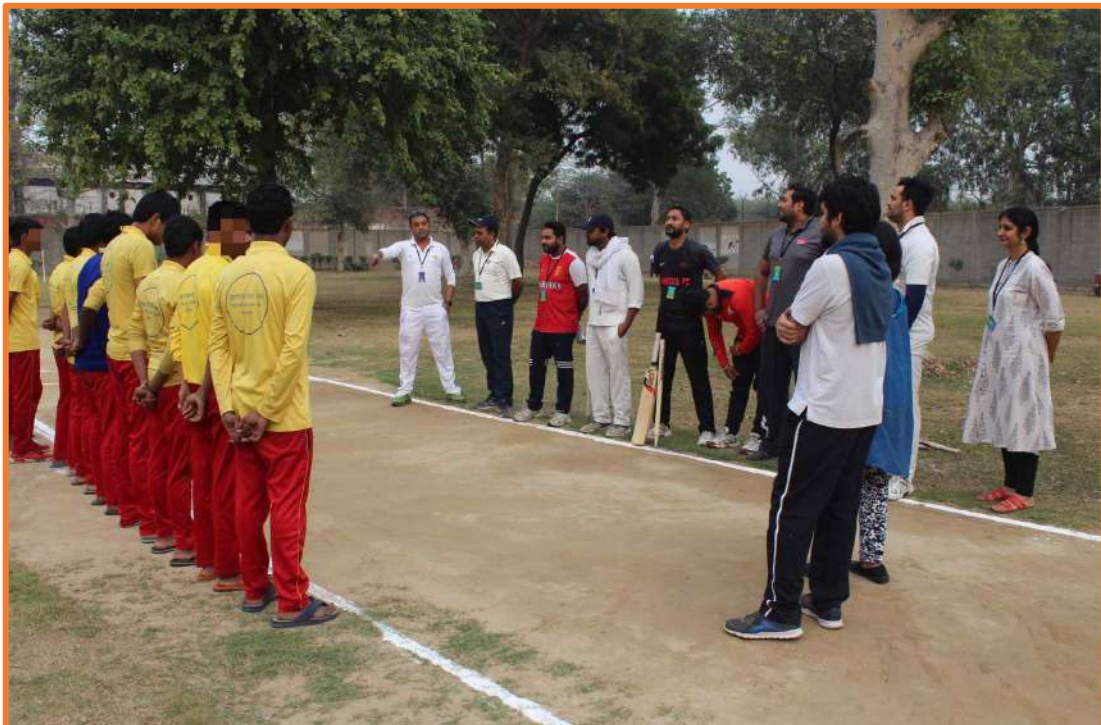
Taken just before a cricket match at the Adharshila Observation Home for Boys, Kingsway Camp, New Delhi in November 2017. The match was played between inmates at the Home and employees from Denave .

The year 2017 saw us working deeply with young offenders, alongside connecting with other stakeholders and strengthen our resolve to work towards rehabilitation of offenders living in Observation Homes.