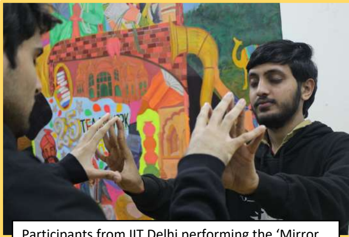
Participants from IIT Delhi performing the 'Mirror Activity' as part of their orientation workshops

We did a short sensitization and awareness program with students from IIT Delhi. Our facilitators introduced participants to various techniques of theatre through an intensive workshop module.