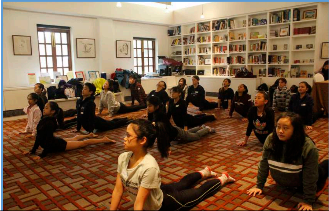
The Physical Theatre Workshop conducted with participants, aged 14-18 brought together an amalgamation of Physical Theatre techniques from India, with experiences from Hong Kong